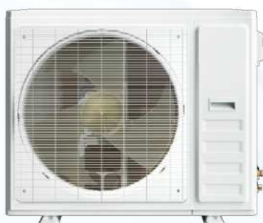
UNITATE EXTERIOARA 24000-55000BTU